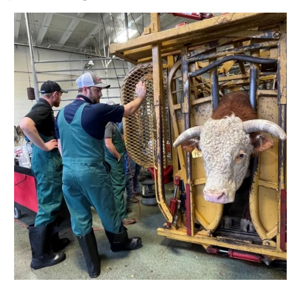
Being able to use live bulls provided a tremendous learning experience.