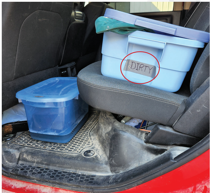
Options for managing "zones" in the veterinary vehicle. Top: Maintain a clean zone, keeping dirty clothes/outerwear and footwear out. Wash hands before entry.

Above: Use containers for soaking clean boots/footwear in disinfectant between calls (cover/seal before driving). Separate container for dirty clothes/outerwear/coveralls.