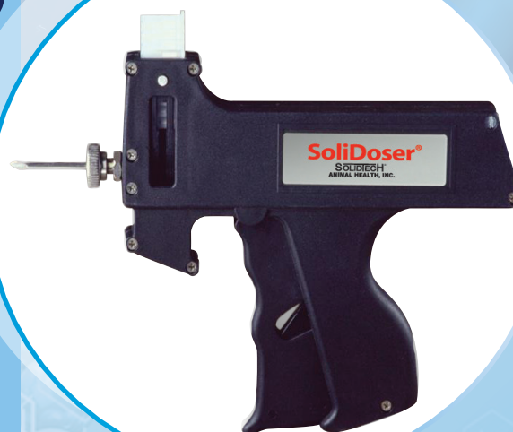
SOLIDOSER® DELIVERY SYSTEM