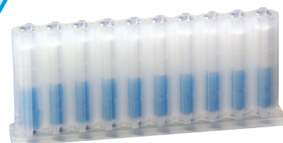
SOLIDOSE® CUSTOM BIOLOGICS