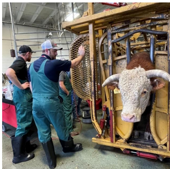
Being able to use live bulls provided a tremendous learning experience.